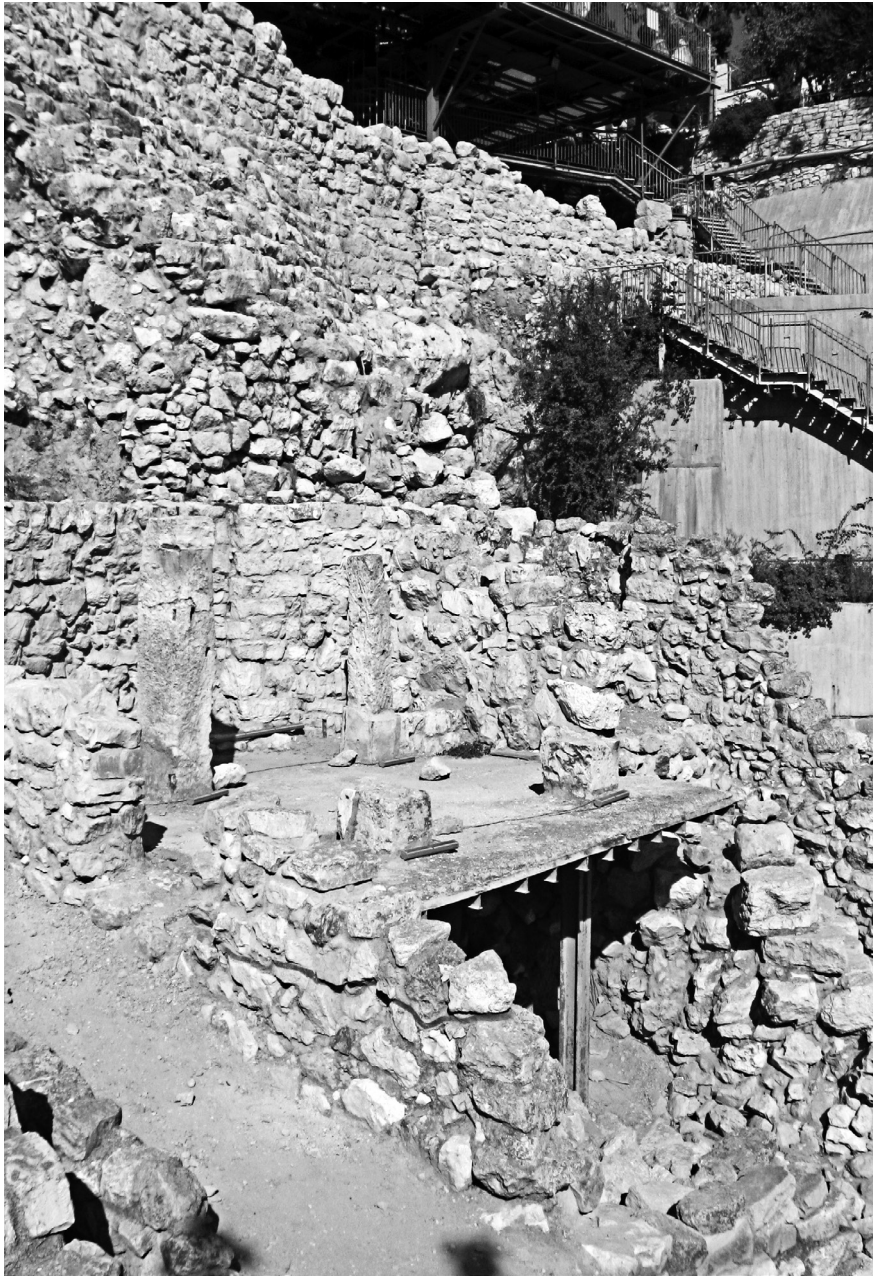
City of David excavation site.